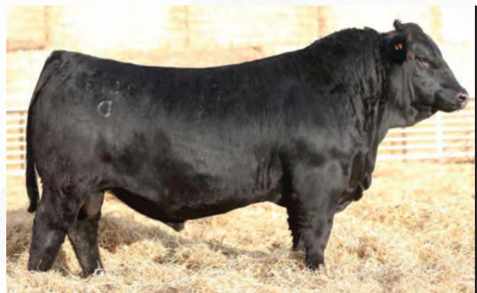
LFE Night Hawk 3013D