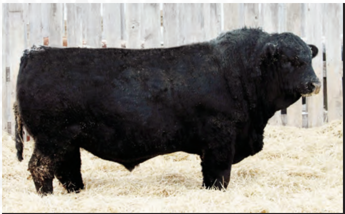
BLCC Mr Sheriff 327E