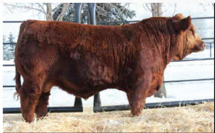
KWA FLYF Red Mountain 16Z