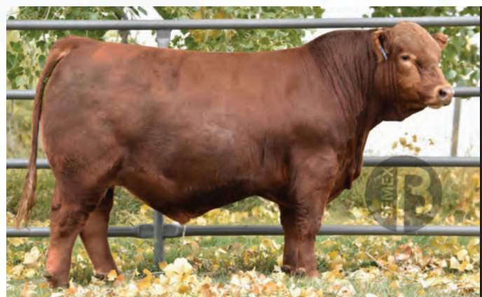
WS Epic E152