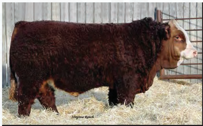
Virginia Spartan 530E