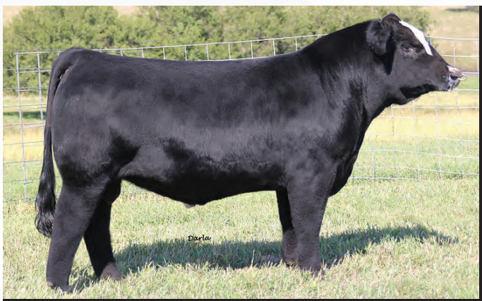
MR CCF Vision