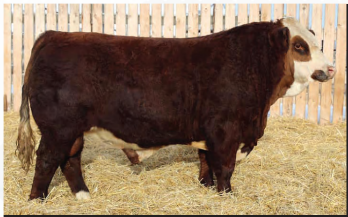
NAC Battle Cry 4F