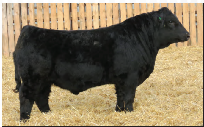
R Plus 5015C