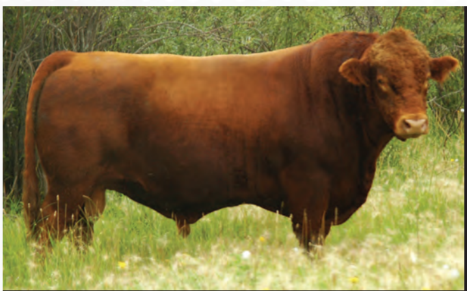
KWA Red Rock 5T