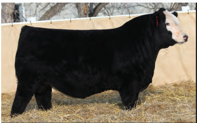
Wheatland Man O' War 907G