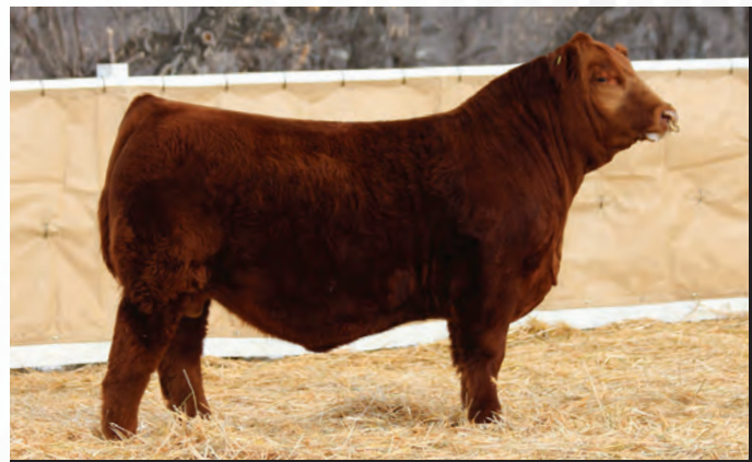
Wheatland Affinity 8196F