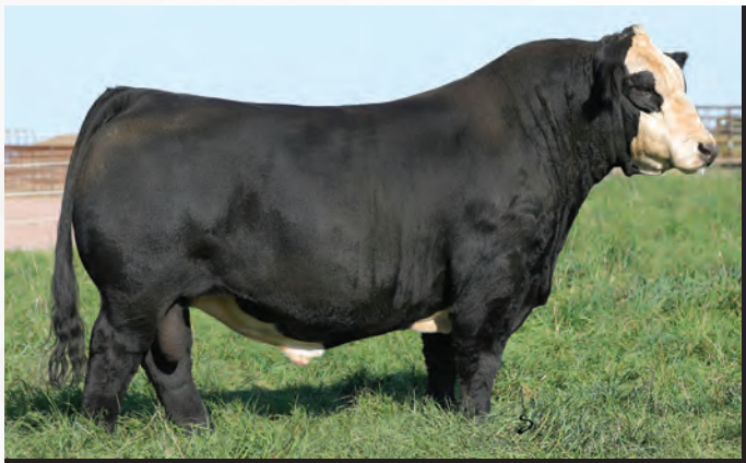
W/C Bankroll 811D